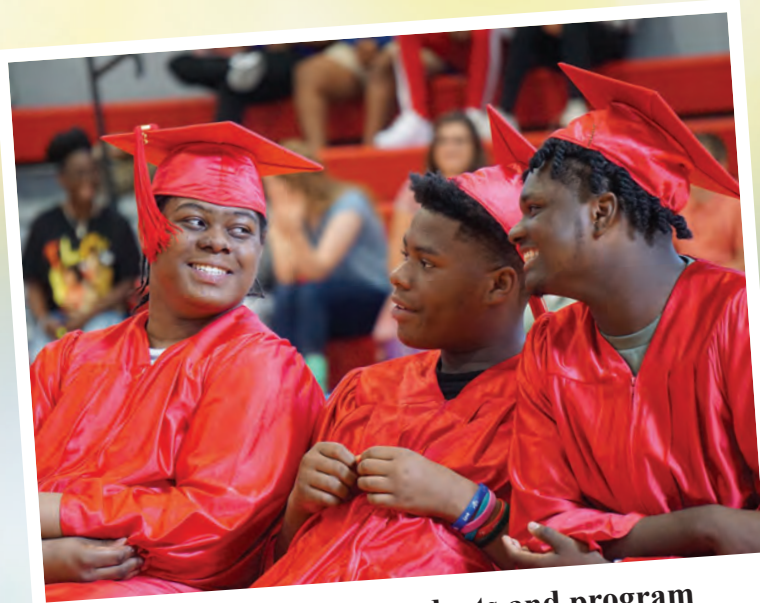
Upon graduation, students and program participants are well prepared for a vocational program or college education.