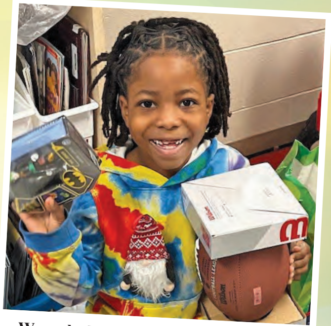
We make birthdays special to celebrate every individual.