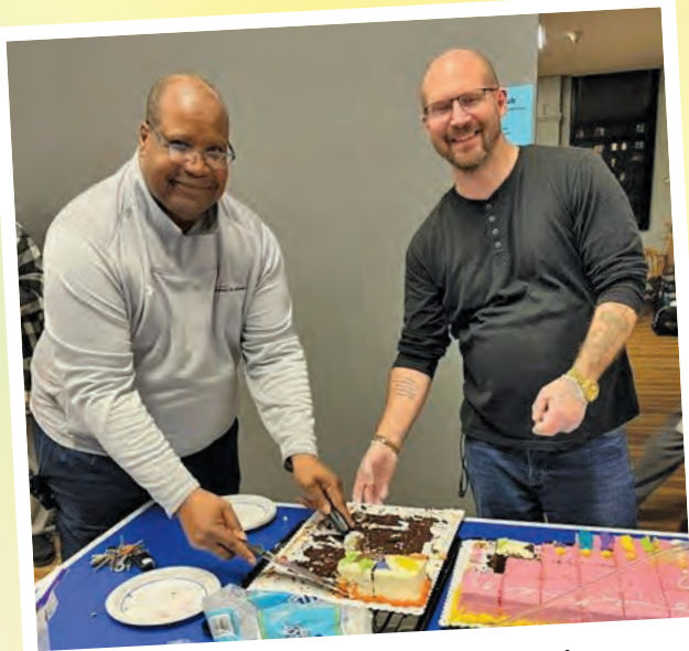
Sobriety comes one day at a time, and milestones are causes for meaningful celebration.