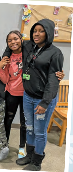
n together. n changes all er.

Scripture calls us to “make a joyful noise” (Psalm 95:2) when we celebrate God’s good gifts, and those gifts are on full display at MRM. Struggling neighbors come through our doors and find love, grace and new life. That’s plenty of reason to celebrate ... and your gifts help make it all possible. Thank you!