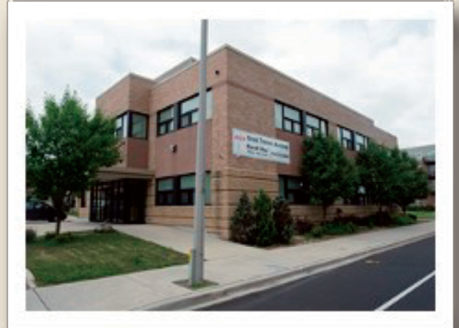
North Campus 1530 W. Center Street Milwaukee, WI 53206