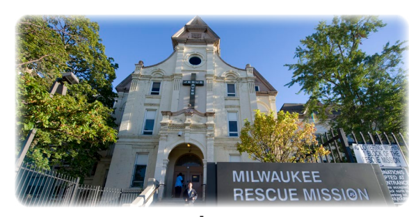
Central Campus 830 N. 19th Street Milwaukee, WI 53233