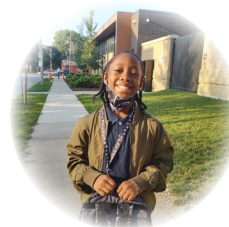
Cross Trainers Academy (students)

1530 W. Center Street Milwaukee, WI 53206