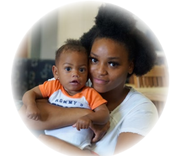
Joy House (women and children)