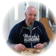
Safe Harbor (men)